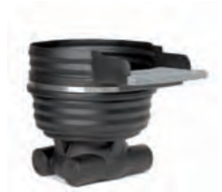
Up to 5,000 GPH Bio Waterfall Filter ITEM 571010 MODEL F1000