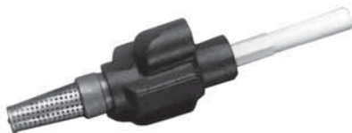
Parallel Pipe Injectors