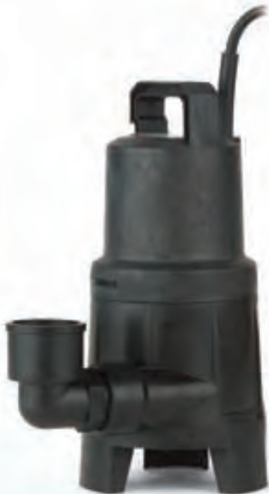
1250 GPH, 1/10 HP SOLIDS-HANDLING