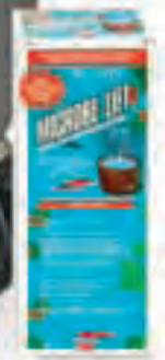
PL LIQUID CLARIFIER INCLUDED